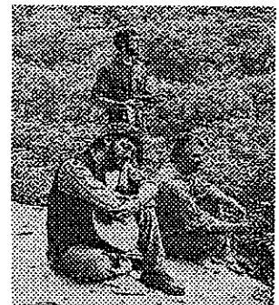
The Unfortunate Rakes