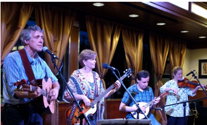
June 2018 at Amphora - Song Garden

If any member would like to renew now you can follow the above instructions (your expiration date is on your newsletter label or in your newsletter email). We will set the new expiration date to what it would have been if you had renewed on time. After we get going again and a month has passed with no renewal we'll inactivate expired members and stop sending newsletters – but don't let this happen to you.